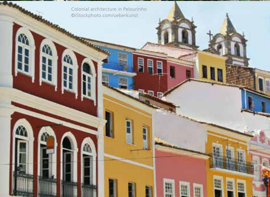
Colonial architecture in Pelourinho