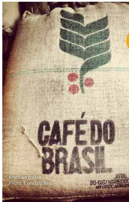
Brazilian coffee