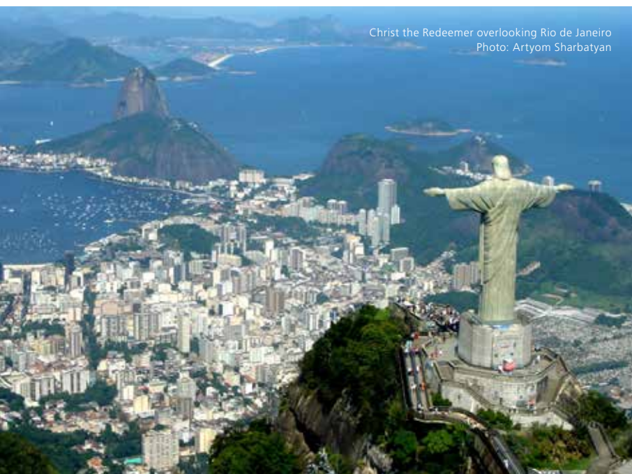
Christ the Redeemer overlooking Rio de Janeiro

The Pelourinho in Salvador is the most important grouping of 17th- and 18th-century colonial architecture in the Americas, according to UNESCO. Check out the city's scenic churches, but leave time for its beaches. A series of interconnecting streets and roads provides a nonstop promenade along the shore, from Barra beach downtown to the distant north-coast beaches considered among Brazil's most beautiful.