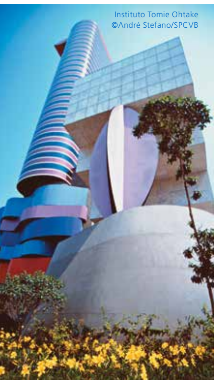
Instituto Tomie Ohtake