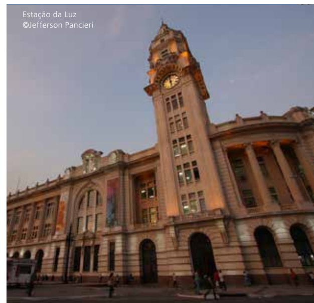
Estação da Luz

These two neighborhoods, São Paulo's bohemia, are home to countless clubs and performance spaces. Samba, shop, and snack — and see some of the city's most vibrant graffiti. Art lovers will want to stop by the SESC Pinheiros arts complex or the Centro Brasileiro Britânico, the official British headquarters in the city, which also hosts lively art shows. The Instituto Tomie Ohtake houses the works of the Kyoto-born Japanese artist, who specialized in geometric forms.