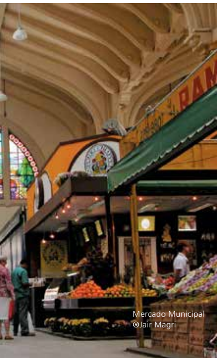
Mercado Municipal

Brazilians love their coffee, and you will find cafes on almost every street corner. The dining triangle of Higienópolis contributes to the city's reputation as a gourmet capital, with Brazilian flavors joining Italian, French, and North American cuisine. You'll find sushi and Asian fare in Liberdade, and sophisticated Italian cuisine — along with amazing views — at the Terraço Itália, close to Praça da República. Be sure to try a pastel, the national snack, a flavorful fried pastry with a variety of fillings.