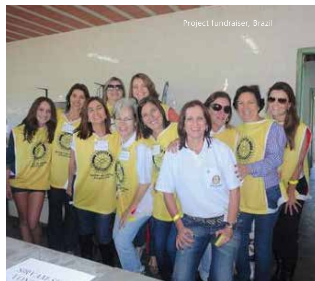
Project fundraiser, Brazil

In Brazil, the families of Rotary members are actively involved in Rotary. Many clubs have Associations of the Rotary Family, also called Houses of Friendship by Brazilians, formed by spouses who support club service projects and activities.