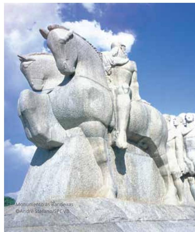
Monumento às Bandeiras