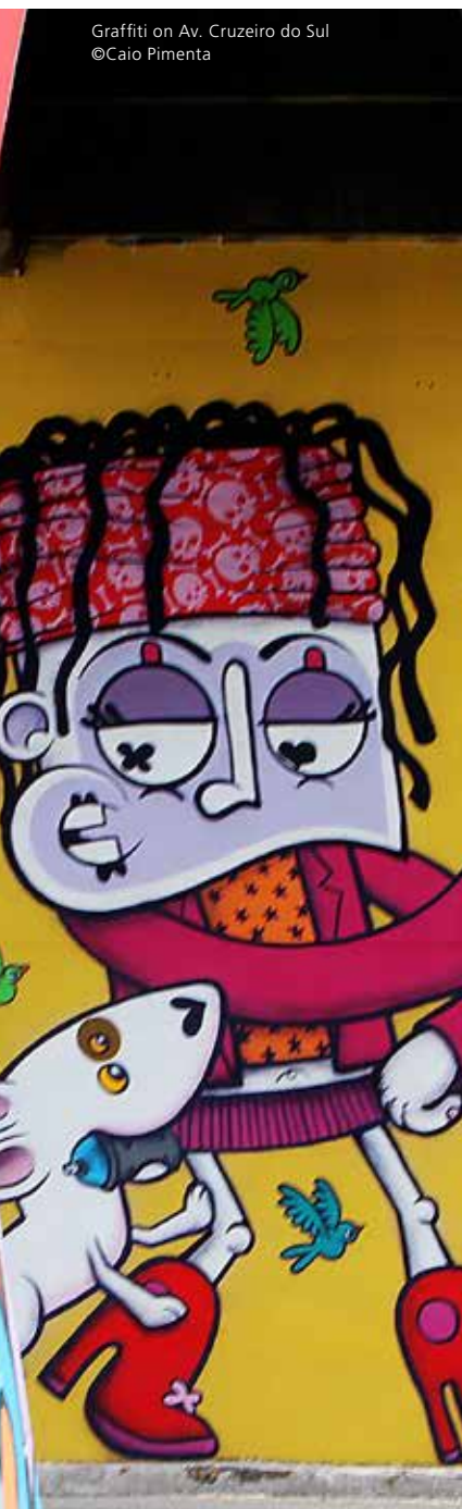
Graffiti on Av. Cruzeiro do Sul

The Higienópolis district is family-friendly and full of greenery, great dining, and good shopping. Visit the museum underneath the bleachers of the Estádio do Pacaembu football stadium to get inside Brazil's national sports obsession. The Barra Funda area is home to the Memorial da América Latina, a futuristic architectural gem designed by 20th-century Brazilian architect Oscar Niemeyer, who also designed most of the buildings in Ibirapuera Park.